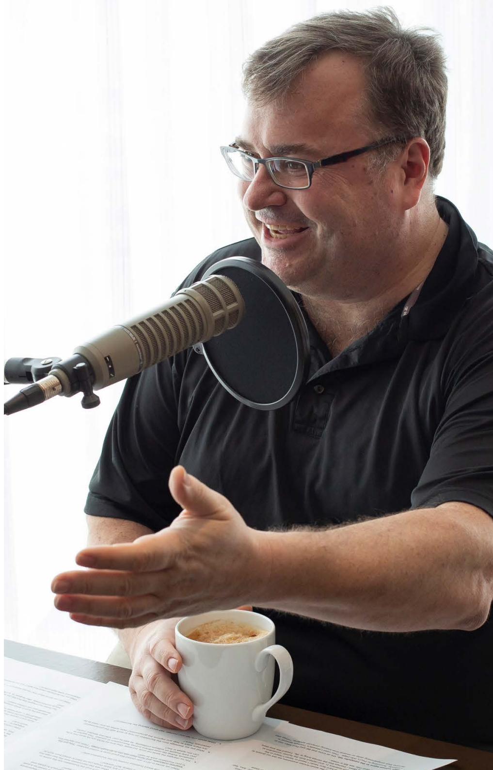
Reid Hoffman LinkedIn Co-founder and host of Masters of Scale podcast